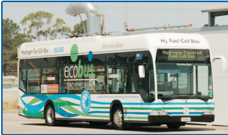
DaimlerChrysler Mercedes-Benz Citaro fuel cell bus, tried at Perth, WA, Australia

Go to where the market is! www.fair-pr.com