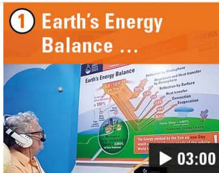
The Energy emitted by the Sun on one Day would supply the Energy needs of the whole World for almost 30 Years! ...