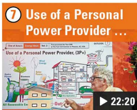
One of Arno's Energy Ideas Vol. 3 The Use of a Personal Power Provider 3P+ from the year 2003 ...