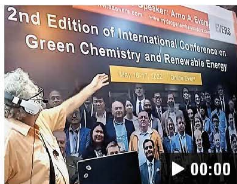
Welcome to my Keynote Presentation. Just keep looking to the end, there is still a lot to come ...