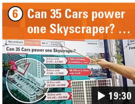
One of Arno's Energy Ideas Vol. 2 Can 35 Cars power one Skyscraper? From the year 2005 ...