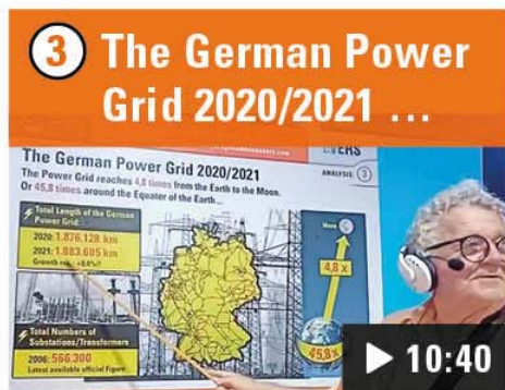
The Power Grid reaches 4.8 times from the Earth to the Moon. Or 45.8 times around the Equator of the Earth ...